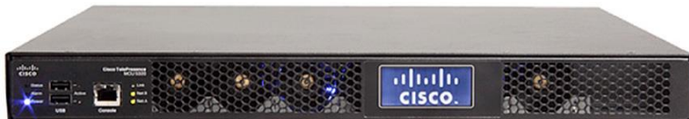
Figure 2. Cisco TelePresence MCU 5300 Series Is Standards-Based and Compatible with All Major Vendors' Endpoints